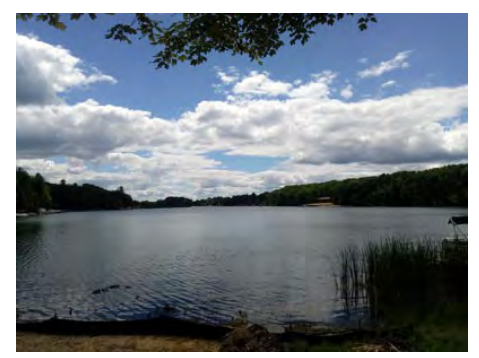
There are number of places along the ride where you can stop.