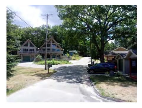
Hillcrest is one of the quiet residential streets you will travel.

ooking for something to do while in Harrison? Take a leisurely 4.2-mile ride or walk around Budd Lake. The 175acre lake is a favorite for those who like to be on the water, but it's also a great place to simply walk or ride, thanks to the sidewalks and quiet streets that surround it.