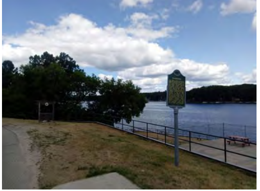
Saxton park just south of Wilson State Park is a good place to fish and picnic. No bikes allowed in the park that is on the water, though because of the steep grade.

work—but only a little. It's still a good activity for families with children. Have fun and if you ride, wear a helmet!