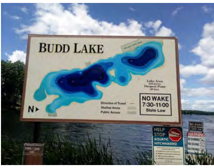
A depth map is at the boat launch at the south end of the lake.